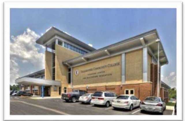
Ghazvini Center for Healthcare Education

During business hours, the TSC campus is open to students, parents, employees, contractors, and guests. During non-business hours, access to campus facilities is restricted to those with issued keys and to those admitted for access by TSCPD after verification of identity and authorization.