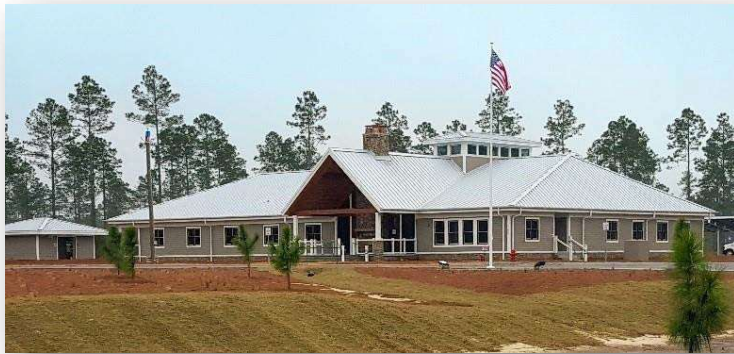
Wakulla Environmental Institute