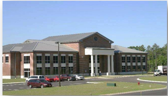
Florida Public Safety Institute Pat Thomas Law Enforcement Academy